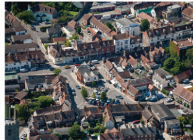
Above: The historic centre of Wareham with North Street running across the picture. In 1782 the destroyed sea front of the town, which was rebuilt following the earlier street pattern. Left: The River Frome flows under South Bridge, with the ancient minster church of St Mary in the centre of the picture. Strangely placed between the Rivers Frome and Piddle, Wareham was an important settlement in past centuries, but a sitting up of the Frome coupled with the constraints of the site, meant that other towns grew at Wareham's expense.