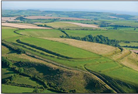
Eggardon Hill Iron Age hill fort, West Compton Abbas.