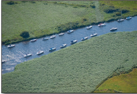
The River Stour at Christchurch.